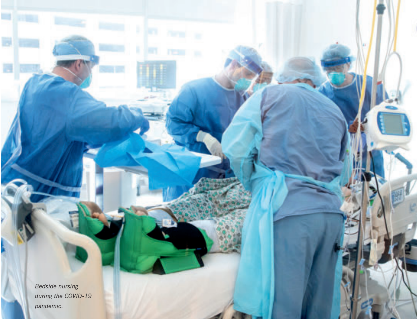
Bedside nursing during the COVID-19 pandemic.