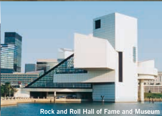
Rock and Roll Hall of Fame and Museum