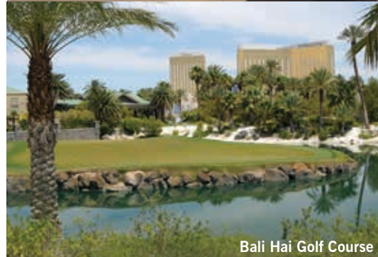
Bali Hai Golf Course