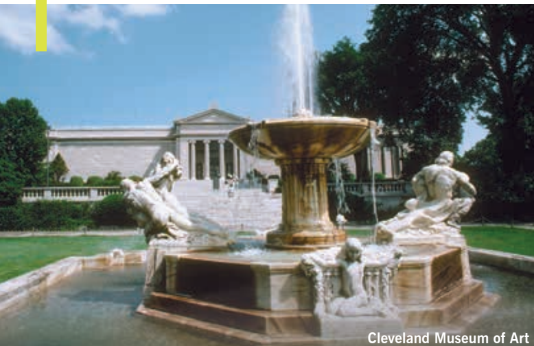
Cleveland Museum of Art

Live in a medical mecca. Enjoy the influence of a multinational city from a national rib cook-off downtown to ongoing summer festivals in Little Italy. Bike the Metroparks. Visit the Cleveland Museum of Art, the Rock and Roll Hall of Fame, or take in an outdoor concert at Blossom, the summer home of the world-famous Cleveland Orchestra. Support the slow food movement at the nationally-renowned West Side Market.