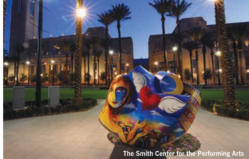
The Smith Center for the Performing Arts