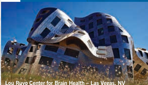
Lou Ruvo Center for Brain Health – Las Vegas, NV