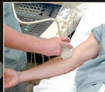
Venous ultrasound test being performed on an arm