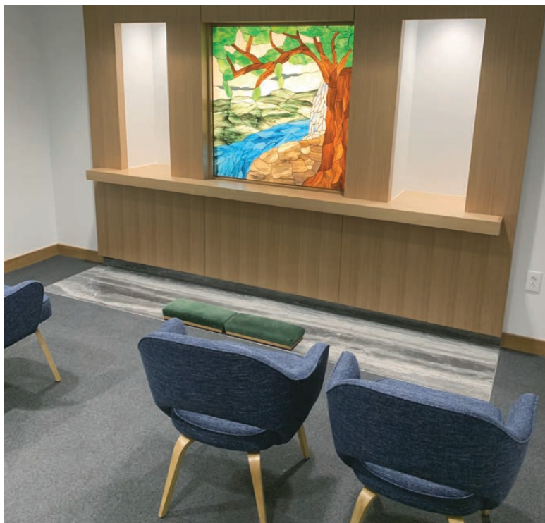
New adjustable lighting and flooring.