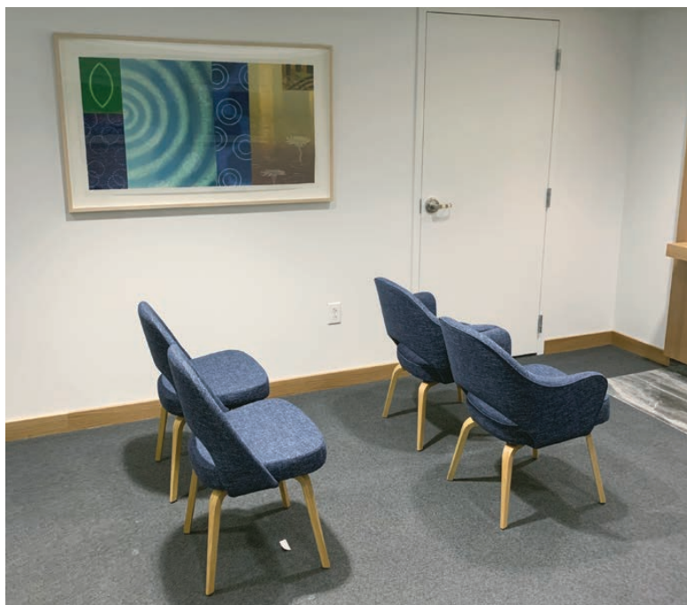
New furniture outfits the space.

"My dad's decline happened over a period of six years, and in the last months, through hospice, he had harp therapy, massage therapy and spiritual care, in addition to great clinical care. We were incredibly moved by how these alternative therapies enhanced my father's comfort. Medina Hospital also cared about my mom, myself, and my family's wellbeing, and helped us work through a difficult process. My mom spent her final days in palliative care at Medina Hospital, and they were so helpful and supportive. Harp therapy and prayer time in the chapel and at their bedsides helped a lot. We started a harp therapy fund in honor of mom and dad because we realized our best way to help in healing was to enhance what the medical team did with prayer, calmness and encouragement. I often take time to visit the chapel when I am there. It's nice to know that there's a quiet, spiritual energy right in the center of the hospital."