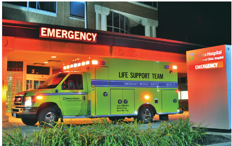
Life Support Team at Medina Hospital