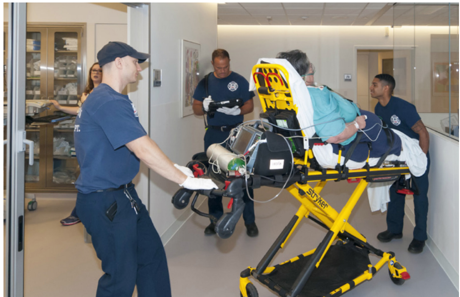
First responders providing care. Photo taken prior to 2020.

Medina Hospital Foundation funding also is important because “every agency is always trying to do more with less, and this funding allows our agencies to participate without a big impact to our own budget,” he says. “It shows us that the hospital and hospital foundation appreciate what we do and want to be involved.”