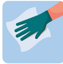
3. Apply disinfectant (disinfect)