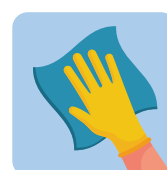
Education & training