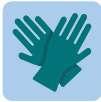
1. Put on PPE

Proper cleaning and disinfecting generally follows these five steps.