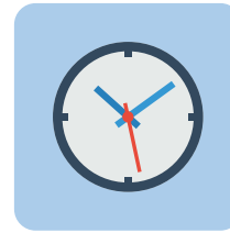
4. Wait (contact time)