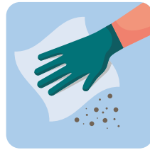
2. Remove soil (clean)