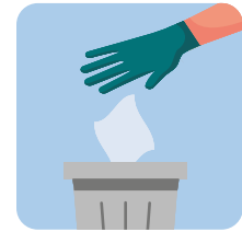
5. Discard or reprocess tools