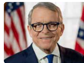
MIKE DEWINE Governor